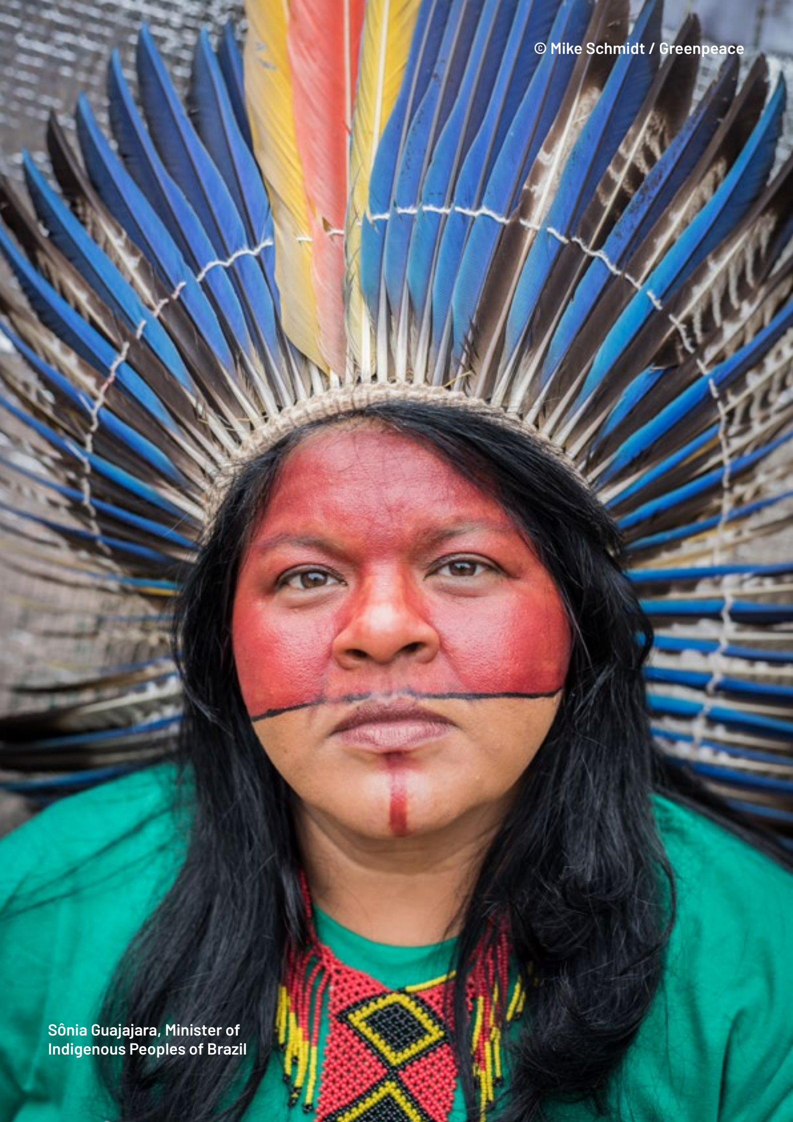
Sônia Guajajara, Minister of Indigenous Peoples of Brazil