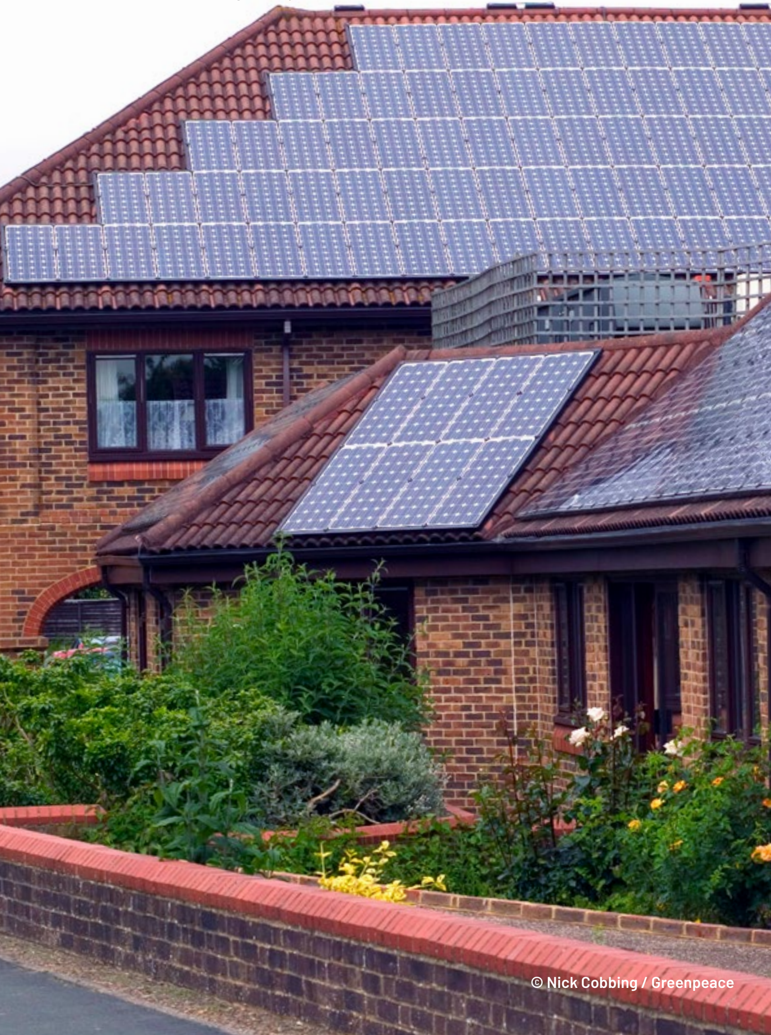
Solar panels on roof in Woking, Surrey