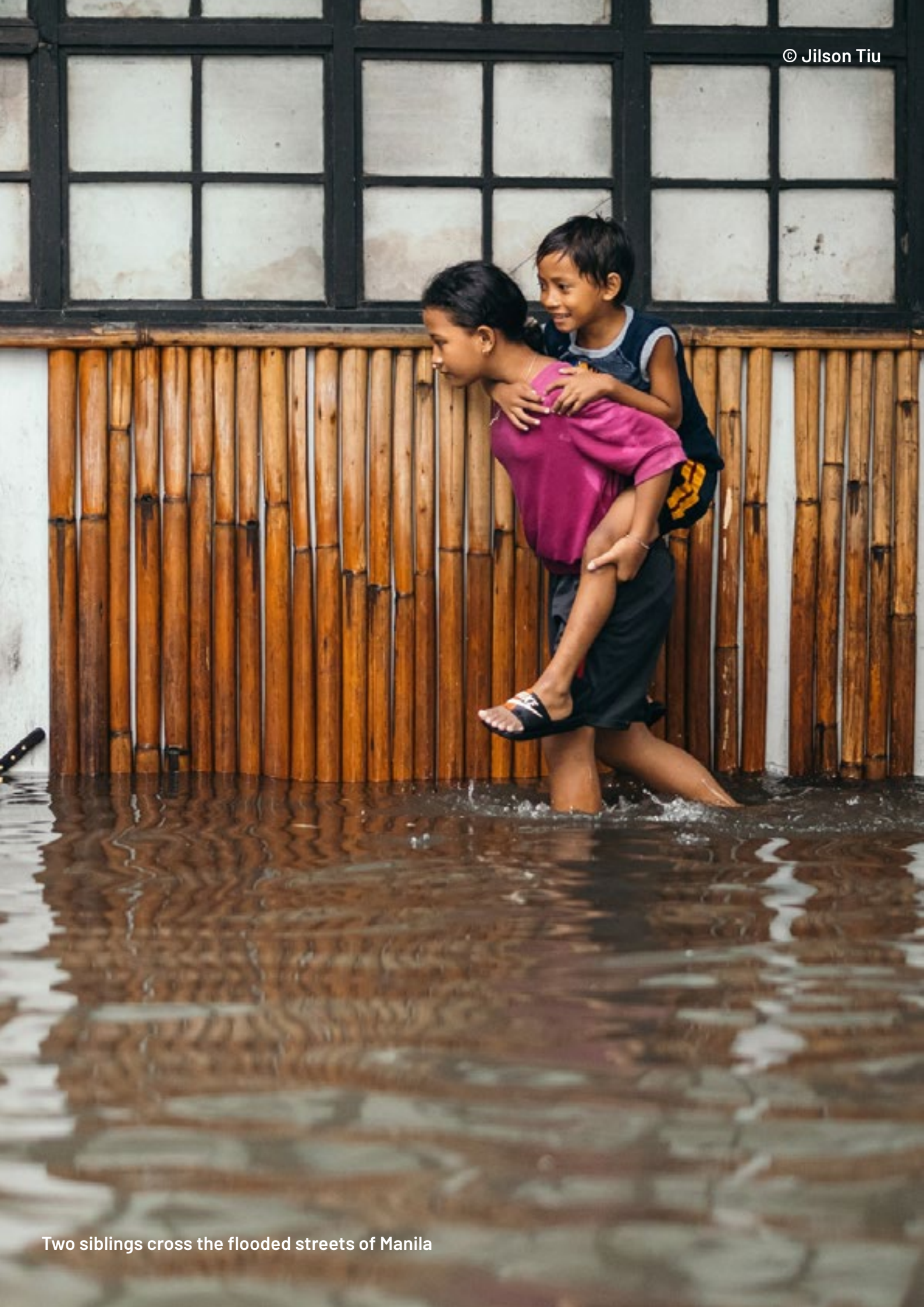
Two siblings cross the flooded streets of Manila