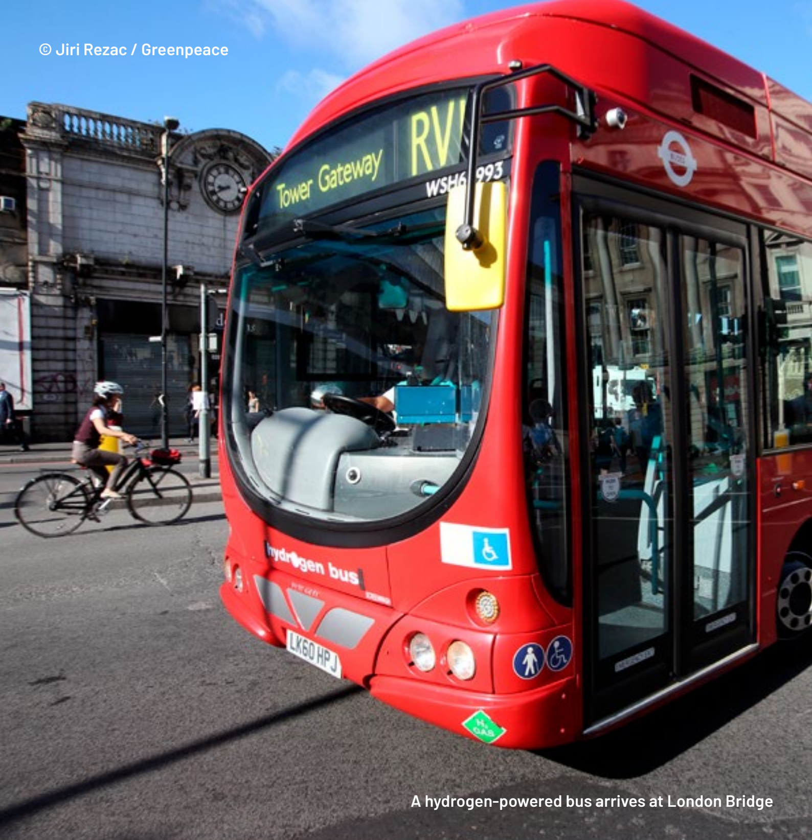
A hydrogen-powered bus arrives at London Bridge