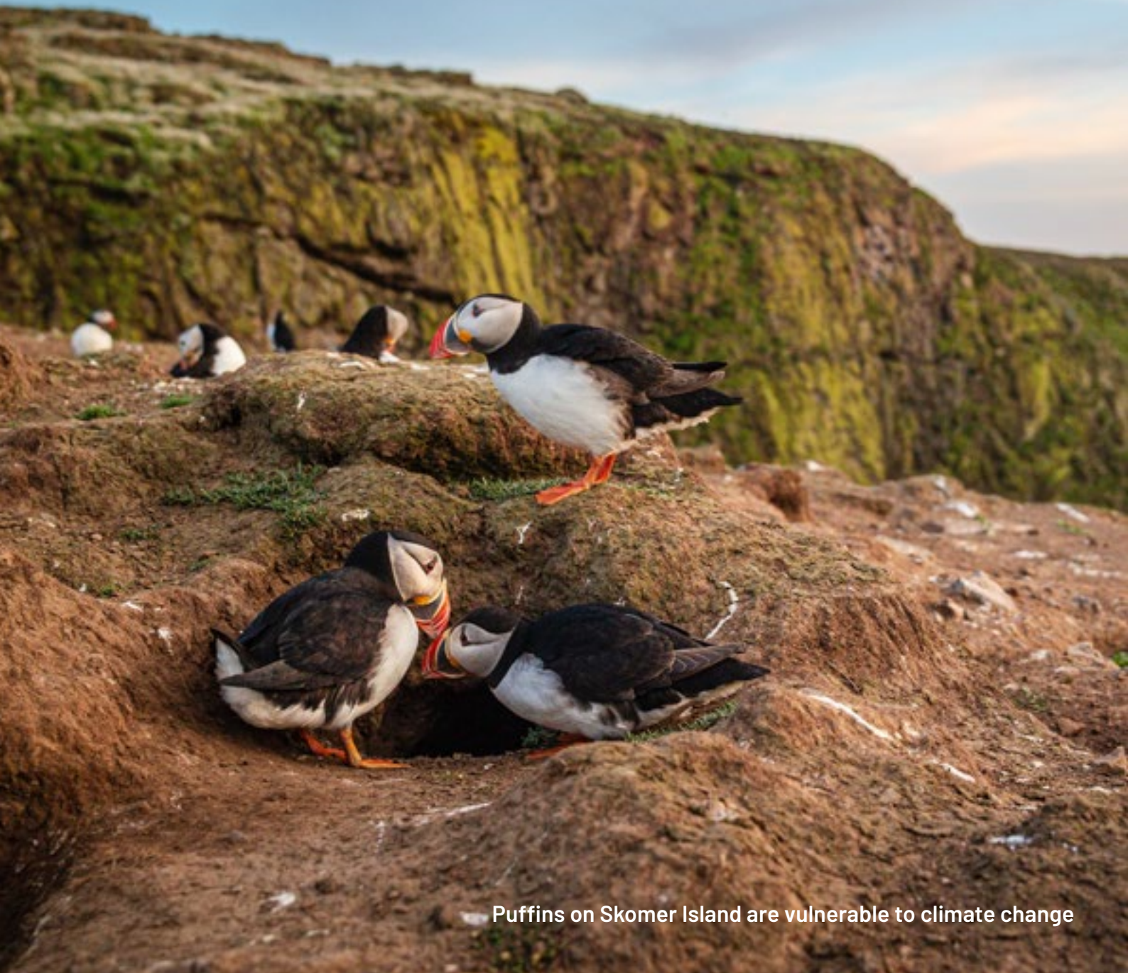
Puffins on Skomer Island are vulnerable to climate change