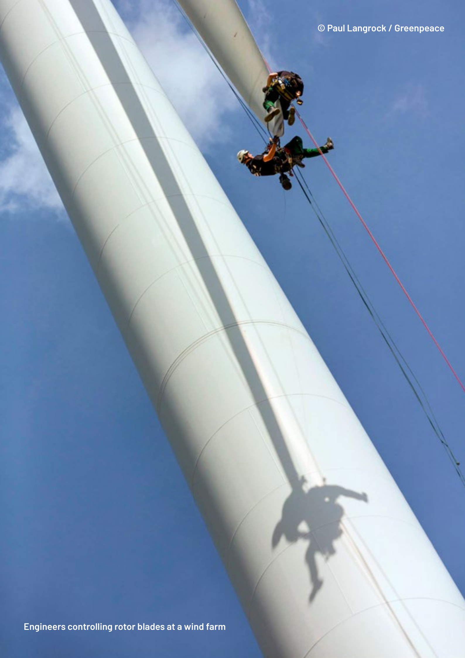
Engineers controlling rotor blades at a wind farm