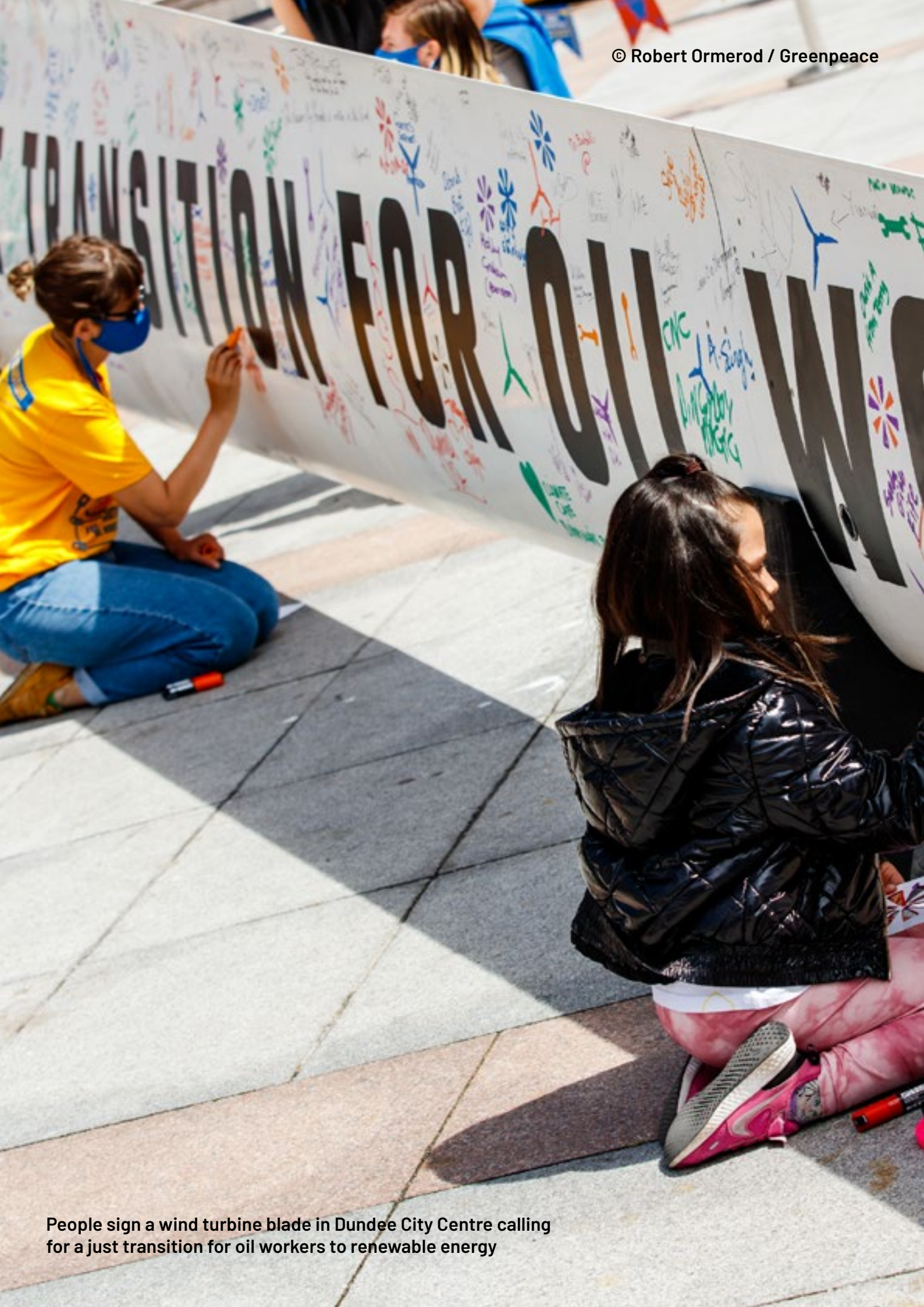
People sign a wind turbine blade in Dundee City Centre calling for a just transition for oil workers to renewable energy